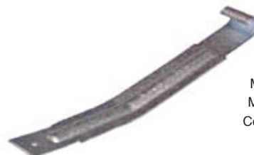
Multiclad Multispan Corrugated