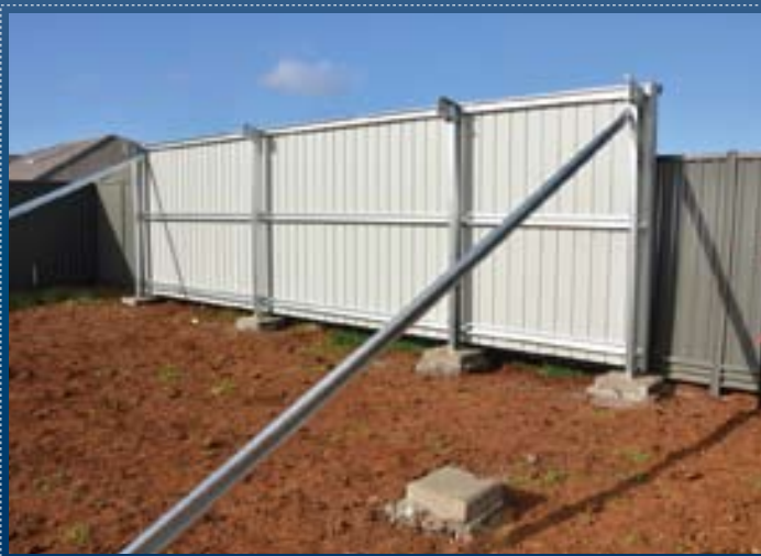
BUILD ON A BOUNDARY