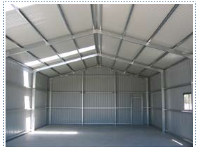
SKYLIGHTS, MANDOOR & WINDOWS