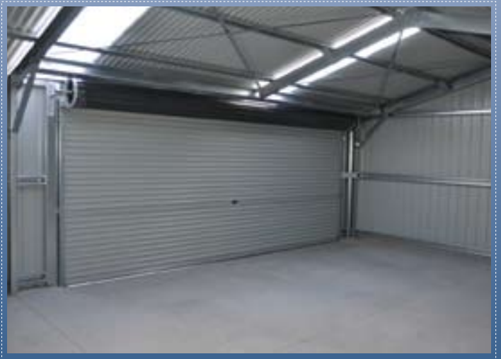
LARGE SIDE ROLLER DOOR