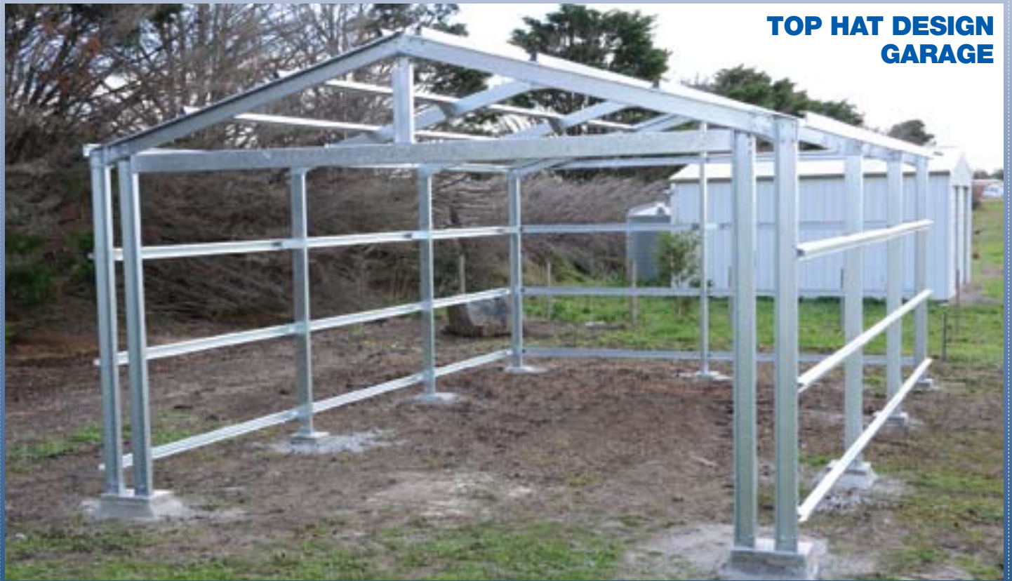
TOP HAT DESIGN GARAGE