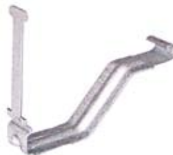
GUTTER STIFFENER For fixing to Metal Fascia