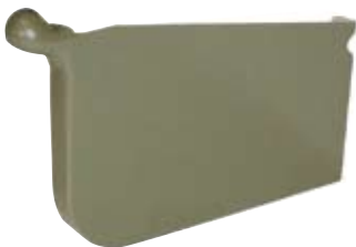
STOP END Zincalume or Colorbond®