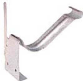
INTERNAL BRACKET Concealed fixing to Fascia