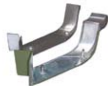
ANGLES Internal & External 45° and 90°