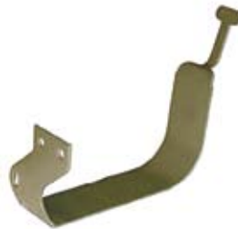
EXTERNAL BRACKET Fixing to Fascia