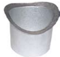
SPECIAL POP 75 and 90mm Diameter