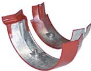
MOULDED CORNER 45° and 90° External Angle Plain or pre-painted