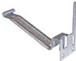
INTERNAL BRACKET Concealed fixing to Fascia