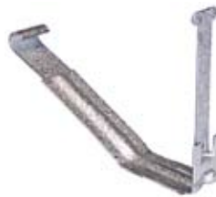
GUTTER STIFFENER For fixing to Metal Fascia