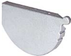
STOP END Zincalume or Colorbond®