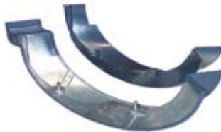
MOULDED CORNER 45° and 90° Internal Angle Plain or pre-painted